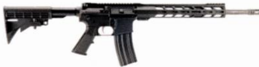
AM-15 Utility Rifle

Drawing will be June 2nd at the Indy 1500 Gun and Blade Show. Limit 1,000 tickets. To purchase tickets, contact Darryle Swartzlander at stlcurt@gmail.com . The winner takes home: