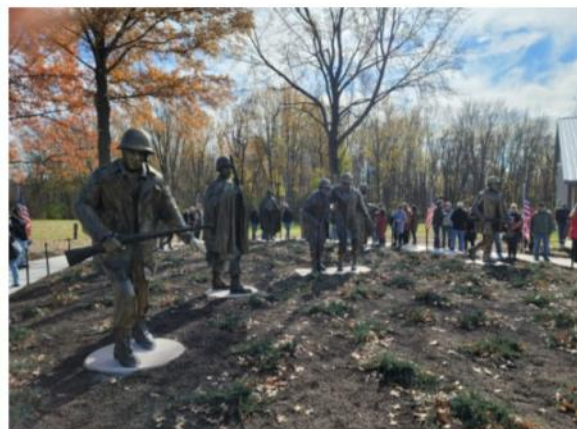
Korean War Memorial