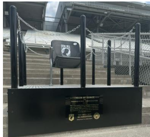
Location of the IMS POW*MIA Chair of Honor Tower Terrace Section 59