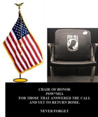
Dedication projected for November 2024

If your organization would like to have one of these special chairs in your venue, please contact mike.clark@indianarollingthunder.com or call 317-991-3085.