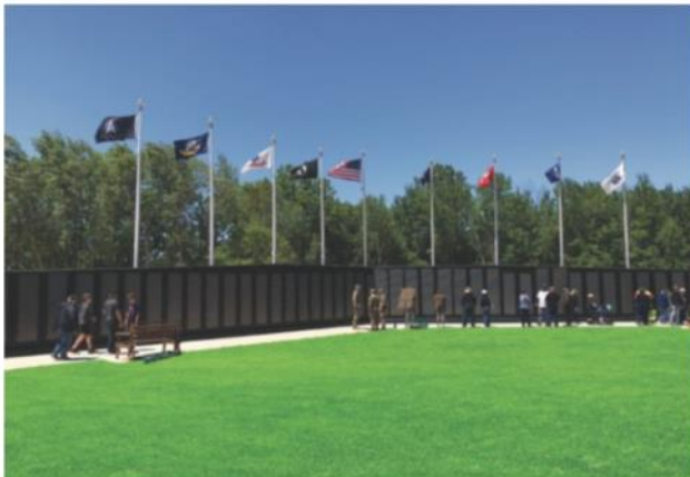
Vietnam Veterans Memorial Wall

Visit our website at www.indianarollingthunder.com or